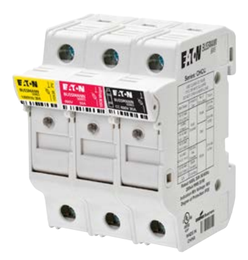
Bussmann series CH global modular fuse holders offer the industry's best ratings.